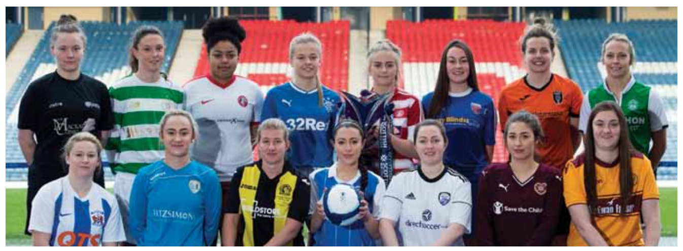
Scottish Building Society has made history by becoming the first title sponsor of the two Scottish women's senior leagues with a six-figure deal over the next three years