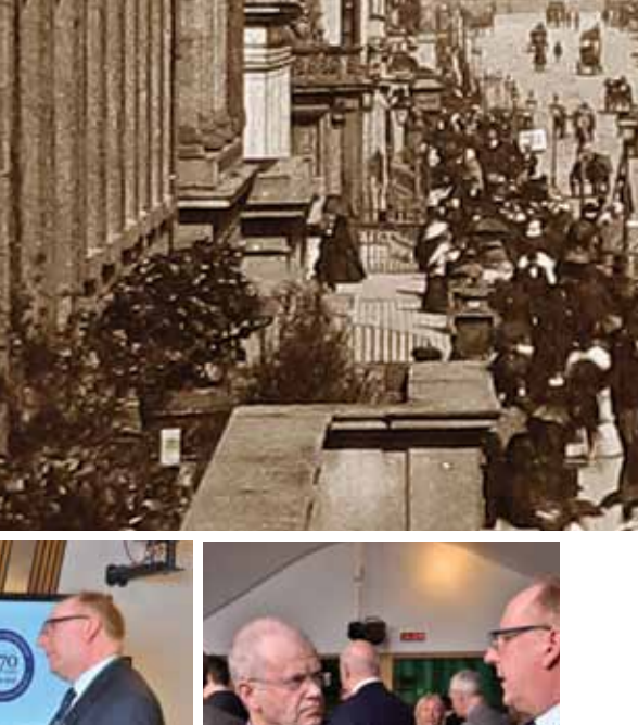
Pictures from the 170th anniversary reception held at Scottish Parliament

O mark this milestone in our history, politicians from all parties joined Society directors and staff past and present to welcome members of our Members' Panel, agents and business associates to a special parliamentary reception. We were delighted to be joined by some of the charities we support and senior representatives from Scottish Womens' Football and to have the Scottish Building Society SWPL Trophy on display throughout the event.